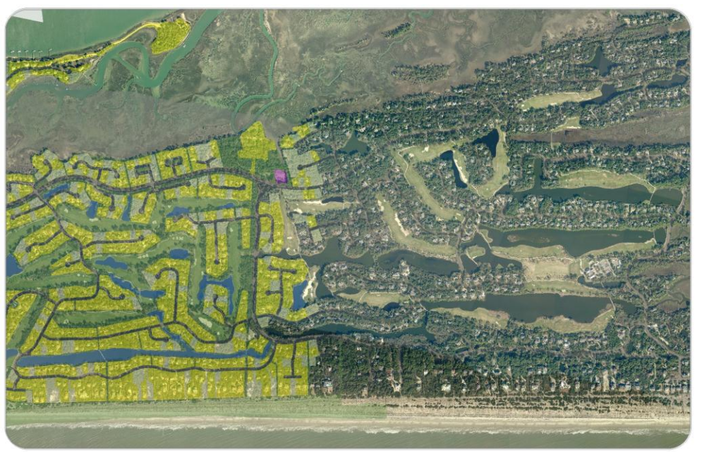
Figure IX.1 depicts the existing land use categories that are present on the Island and percentage of land use compared to the total incorporated area of the Town of Kiawah Island. Geographic Information System (GIS) technology and current Charleston County records were used to detail the existing land use. The land use categories were established based on the general use of each parcel as determined by the Charleston County Assessor's Department. Map IX.1, updated in 2010, entitled "Existing Land Use" illustrates where existing land uses are located on the Island.